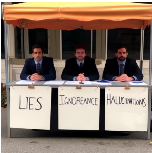
Figure 2: Another image from DALL-E-4

Operational aspects of undesirable output results are important. For example, we need to consider how to detect undesirable output results in real time and how to respond to them. We also need to consider how to communicate the risks of undesirable output results to users. User expectations are also important, but for such a rapidly evolving environment, education is very difficult. For example, users should be aware that generative AI systems are still under development and that they may produce undesirable output results. Users should also be aware that generative AI systems are not human and that they do not possess the same abilities as humans.