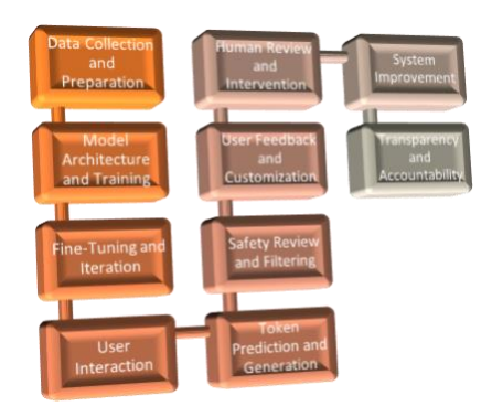
Figure 3: Steps of gAI Process from ChatGPT

The following is a response by ChatGPT when asked about the processes in ChatGPT. Risks and errors can be introduced at each step. The steps may be summarized in the following graphic: