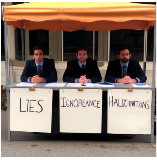
Figure 2: Another image from DALL-E-4

Operational aspects of undesirable output results are important. For example, we need to consider how to detect undesirable output results in real time and how to respond to them. We also need to consider how to communicate the risks of undesirable output results to users. User expectations are also important, but for such a rapidly evolving environment, education is very difficult. For example, users should be aware that generative AI systems are still under development and that they may produce undesirable output results. Users should also be aware that generative AI systems are not human and that they do not possess the same abilities as humans.